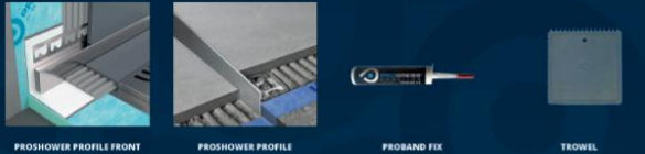
PROSHOWER PROFILE FRONT PROSHOWER PROFILE PROBAND FIX TROWEL